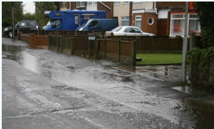
Top of Northern Avenue September 2012