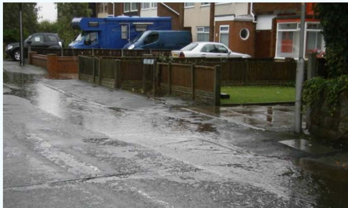
Top of Northern Avenue September 2012