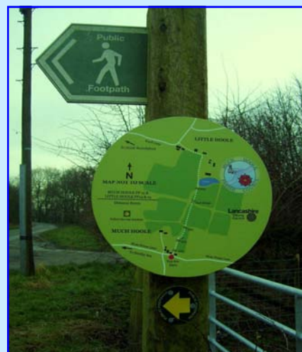
First sign on Moss House Lane just past the Carr Lane turning

Councillors Marion Gelder, Eunice Houghton and Alan Taylor make up the Parish Council working group who are tasked with providing a planted area at the Trafalgar Garden at the northern end of the recreation ground. When complete this should provide a year round colour. The area is likely to be a large oval shape with a variety of shrubs and flowers. South Ribble Borough Council have kindly agreed to do much of the heavy work to get it established. If a local support group of volunteers can be formed to help with planting and maintenance, the scheme should achieve its objectives of providing a bright and cheerful focal point in the village - VOLUNTEERS WANTED. (Please contact the Parish Clerk.)