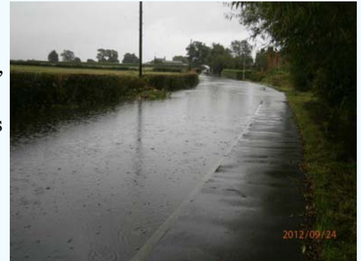
Smithy Lane September 2012